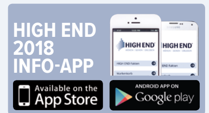
HIGH END App

The app for the HIGH END 2018 can be downloaded from 20th April free of charge in the Google Play Store or in Apple’s App Store and also updated. With the HIGH END app, visitors have all the necessary information on every aspect of the exhibition on their smartphones.