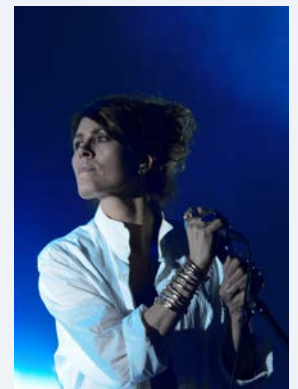
Kari Bremnes on stage > picture download