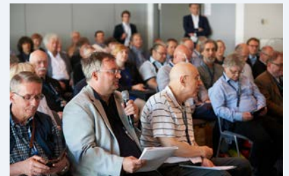
press conference > picture download

At the HIGH END 2018, the so-called “Quartet of Critics” is presented in a public event orchestrated by the HIGH END SOCIETY and the German Record Critics’ Award Association (PdSK). This year, the special award goes to the musician and international star Till Brönner.