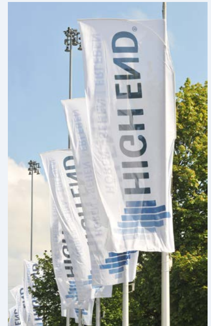
HIGH END signs > picture download

Reprints free of charge – specimen copy requested