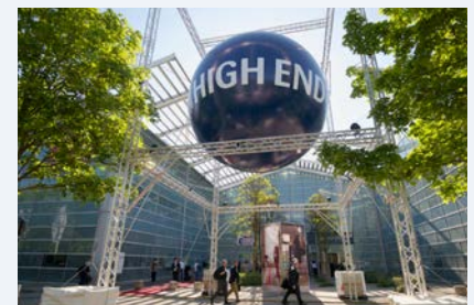
MOC in Munich > picture download